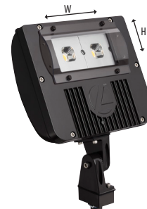
VG - Vandal guard W= 6-1/2" (16.5 cm) H= 4" (10.1 cm)