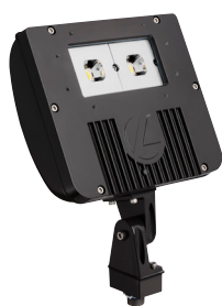
THK - Knuckle with 1/2" NPS threaded pipe