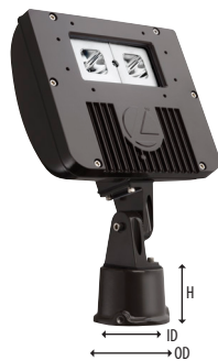
IS - Integral slipfitter H= 2-1/2" (6.3 cm) ID= 2-3/8" (6.0 cm) OD= 3-1/2" (8.8 cm)