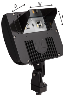
UBV - Upper/bottom visor W= 5-1/4" (13.3 cm) H= 2-1/2" (6.3 cm) D= 3" (7.6 cm)