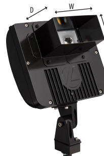
FV - Full visor W= 5-1/4" (13.3 cm) H= 2-1/2" (6.3 cm) D= 3" (7.6 cm)