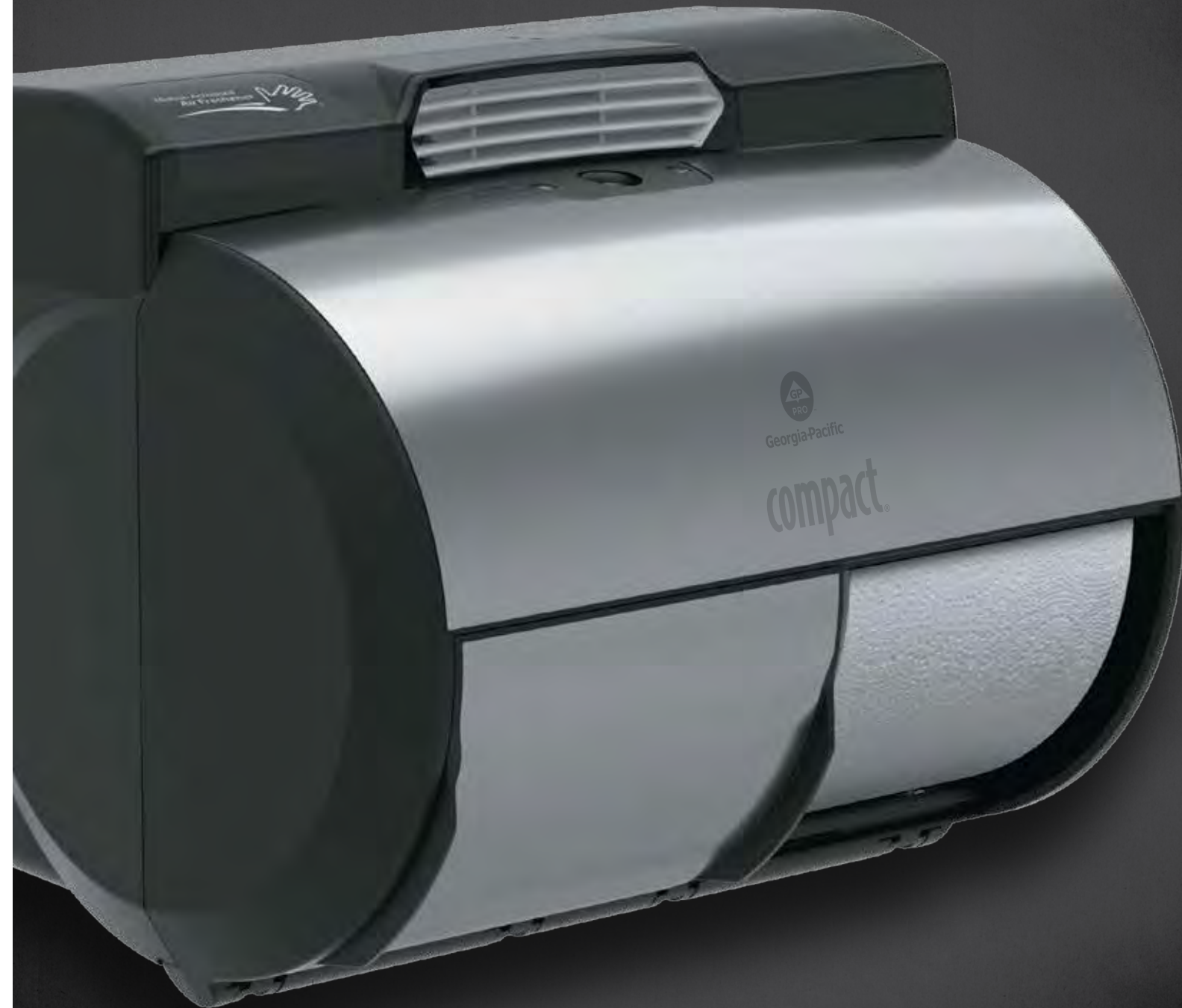
ActiveAire® Automated Freshener Dispenser shown with the Compact® Side-By-Side Toilet Paper Dispenser in Stainless Finish