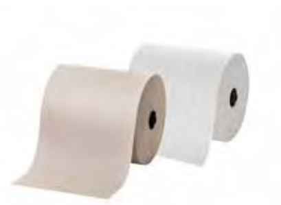
enMotion® Towel Refills

Recycled paper options available, including refills that meet or exceed EPA comprehensive procurement guidelines and can help earn LEED® credits.