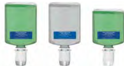
enMotion® Soap & Sanitizer Refills

100% recyclable bottles, contain 25% post consumer content and have select third-party product certifications that can help earn LEED® credits.