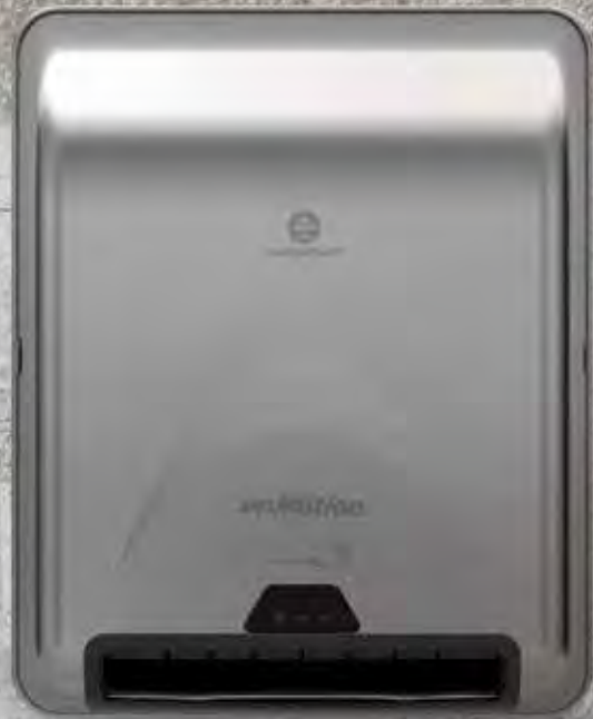
enMotion® Recessed Automated Towel Dispenser