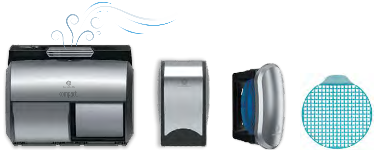
Compact® Side-by-Side Toilet Paper Dispenser with ActiveAire® Automated Freshener Dispenser

Go beyond looking clean with long lasting and highly effective freshness to continuously keep the whole room smelling clean, featuring Compact® with ActiveAire®, delivering first-of-its-kind freshness in the stall.