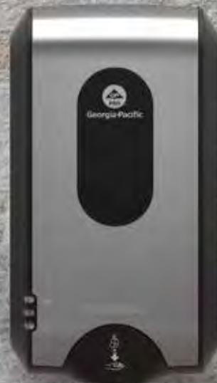
enMotion® Automated Soap and Sanitizer Dispenser