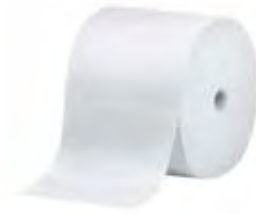
Compact® Toilet Paper Refills

Compact® Coreless Toilet Paper contains 20% post-consumer recycled fiber and meets or exceeds EPA Comprehensive Procurement Guidelines.