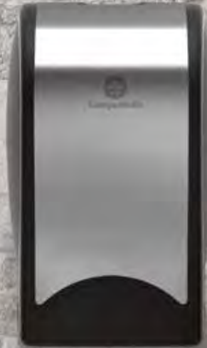
ActiveAire® Powered Whole-Room Freshener Dispenser

Engineered for whisper-quiet dispensing.