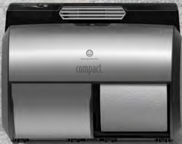
Compact® Side-by-Side Toilet Paper Dispenser with ActiveAire® Automated Freshener Dispenser