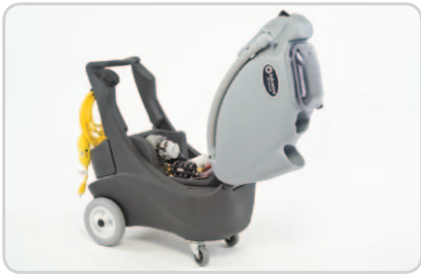
Clam shell design for easy access to the component pallet.