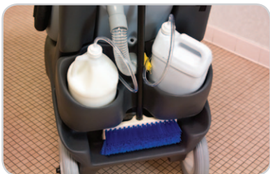
Universal chemical bottle storage.