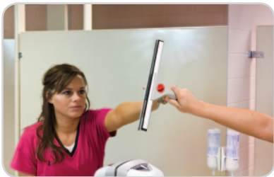
All surfaces are easily cleaned after initial spray down.