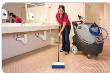
Use the scrub to scrub the floor and any other difficult to clean areas.

Advance's All Cleaner and All Cleaner XP answer the call for an affordable, touch-less approach to cleaning restrooms and other areas with hard surfaces. You'll improve productivity and see better results – now that's smart cleaning.