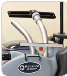
Standard accessories are easily stored on machine.