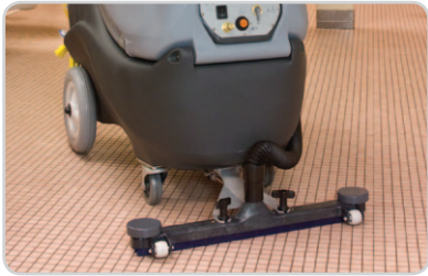
Optional front mount squeegee for easy water pick-up.