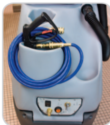
Front storage for pressure washer.