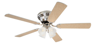
Reversible Bird's Eye Maple Finish Blades