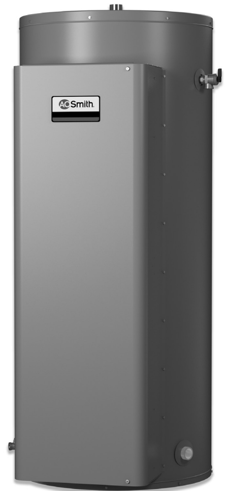
MODELS DRE-52, 80, 120