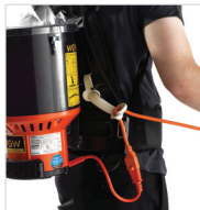
Exhaust fans face outward away from user