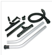
Cleaning Accessory Pack