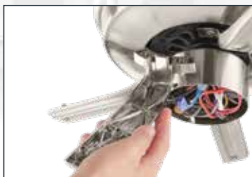
Accu-Arm blade arms with captive screws