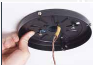
Slide-on Mounting Bracket for quick and easy installation

The 52" Montara fan by Seasons combines sleek transitional styling with the latest design touches to enhance your indoor living spaces. The beautiful finish is complemented with 5 reversible blades for increased décor options. The powerful and quiet 3-speed fan motor is conveniently operated using the included pull chains and is also reversible for year-round comfort and energy cost savings. Installation is a breeze with QuickFit installation features like a slide-on mounting bracket and Accu-Arm blade arms with captive screws.