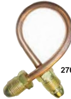
270° Bend Right Hand