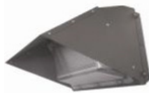
Full Cutoff Cover