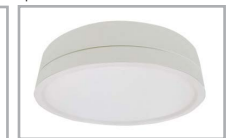
EGRF-BB08PAN 8" Model EGRF-BB12PAN 12" Model Shown installed with fixture (Fixture sold separately) White finish only.