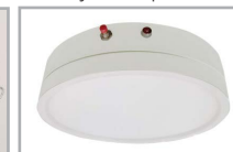
EGRF-BB08 8" Model EGRF-BB12 12" Model Shown installed with fixture (Fixture sold separately) White finish only.