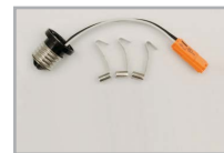
EGRF-RET04 For use in converting 4 in. round ceiling cans