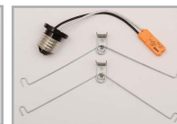
EGRF-RET06 For use in converting 6 in. round ceiling cans