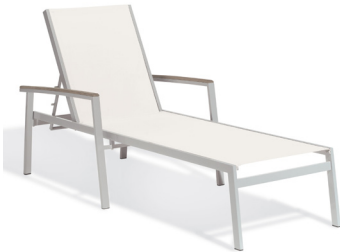
Natural Sling TVL80CV Tekwood Vintage Armcaps