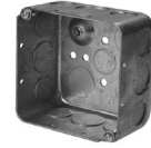
4" square deep steel box 4" x 4" x 2-1/8" (102mm x 102mm x 54mm)