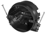
4" round new work non-metallic light fixture/fan box 4" diameter x 2-3/16" (102mm x 56mm)