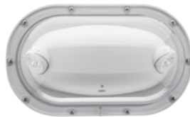
ELM2L shown in WPVS SML