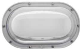
ELM2LF shown in WPVS SML