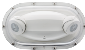
ELM4L-ELM6L shown in WPVS LRG