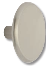
1-1/2" Die-Cast Zinc Knob 800893 Pkg Of 5