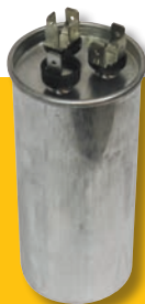
SmartComfort® By Carrier Dual Run 440V 30/5 MFD Capacitor 701875

When resetting the game for the next competitor, position capacitor so brown prong is facing toward the right. Ensure wires are connected to their matching color quick-connects on the capacitor and are not tangled.