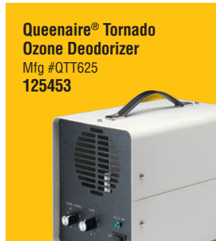
Queenaire® Tornado Ozone Deodorizer Mfg #QTT625 125453

When resetting the game for the next competitor, set both the Timer and Ozone Control Knobs to "1".