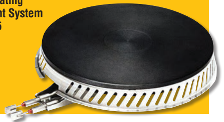
SmartBurner™ 2x2 Heating Element System 193006 Pkg of 4

When resetting the game for the next competitor, reset metal rings loose and on top of their corresponding heating elements. Rings should not be attached to the heating element.