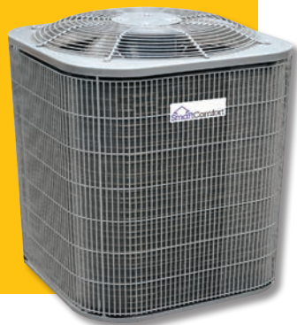
SmartComfort® By Carrier 3 Ton 14 SEER Air Conditioner 282434