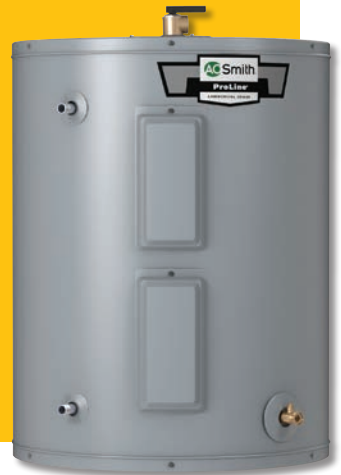
A.O. Smith® 40 Gallon Lowboy Electric Water Heater Mfg #ENLB-40 754124

When resetting the game for the next competitor, secure supply lines by tightening completely and then loosening counterclockwise by a quarter-turn.