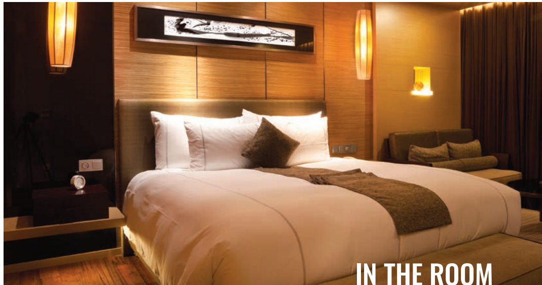
IN THE ROOM

Accommodate guests' every need during their stay. Think soaps and shampoos, extra pillows and towels, stationery, rollaways, and small appliances.